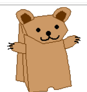
Brown Bear Cut out ears, eyes, and paws. Glue them to the bear. Using a black crayon or marker, draw a nose and mouth. Cut out tiny claws and glue then to the paws.