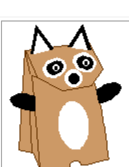
Raccoon Cut out ears, eyes, and a nose. Glue them to the raccoon's face.