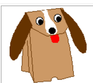
Dog Cut out ears, eyes, a nose, and a tongue. Glue the tongue inside the mouth. Glue the eyes, nose, and ears to the dog's face.